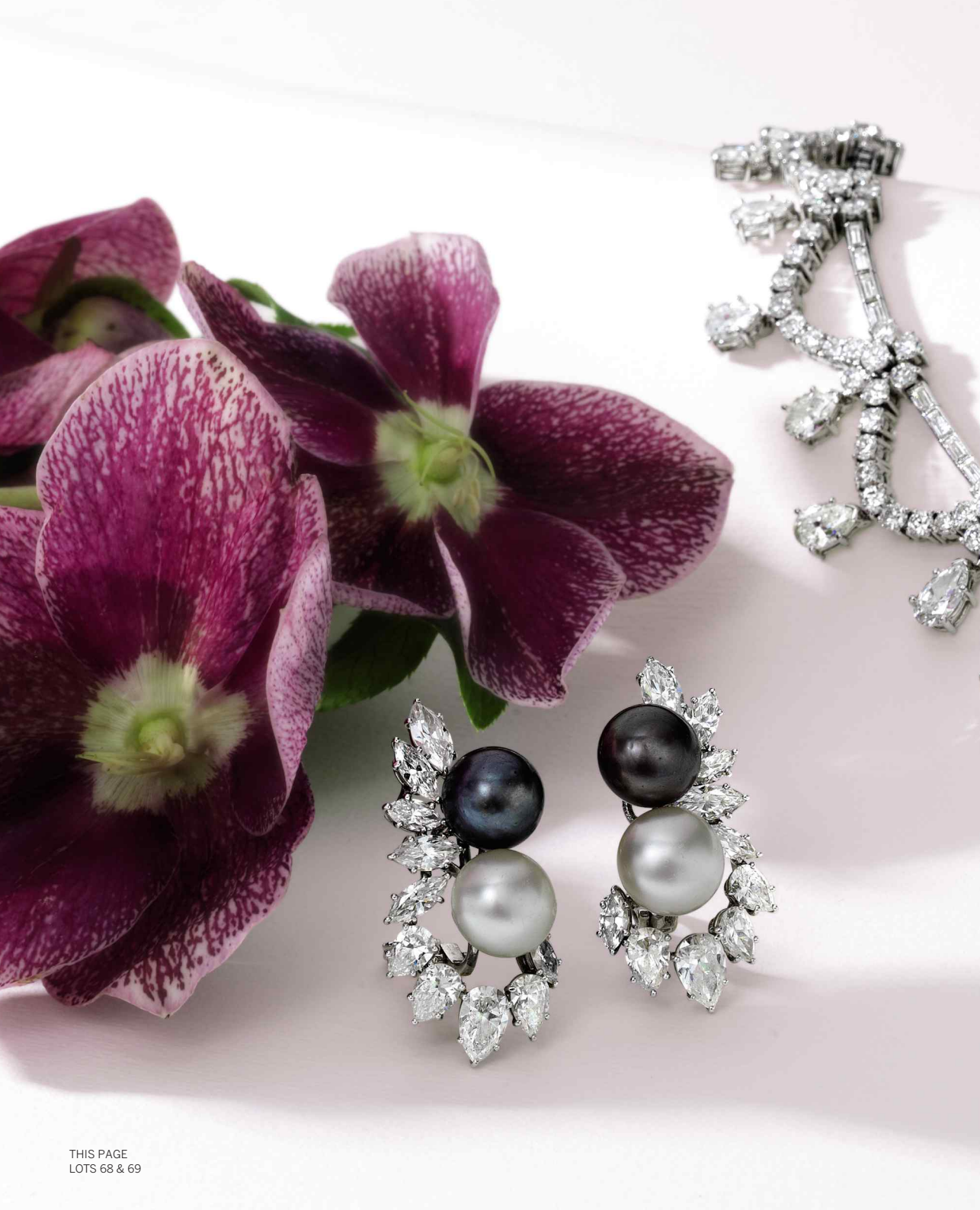
THIS PAGE LOTS 68 & 69