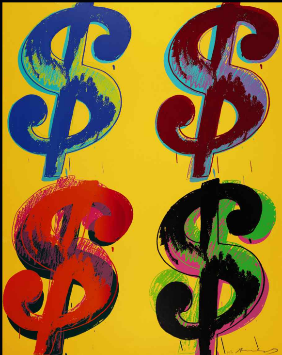
ANDY WARHOL. $(4), 1982